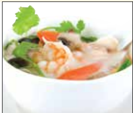
Tom Yum Seafood Soup