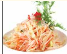
Spicy Kani Salad