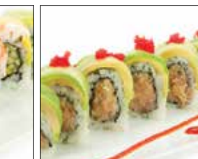
Every Green Roll