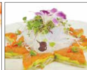
Spicy Tuna Avocado Pizza