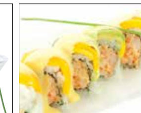
Lobster Mango Roll