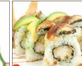
Black Dragon Roll